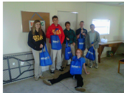
7th & 8th grade class